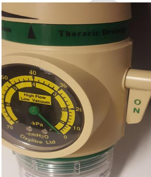
Figure 4 Attachment of the Replogle tube to the low suction unit