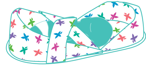
Baby in Nest