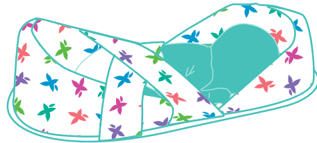
Baby in Nest