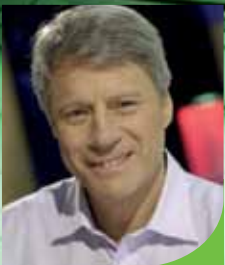
Nick Ross Broadcaster and Moderator of the HC Conference

For informaticians, clinicians and senior managers across health and social care