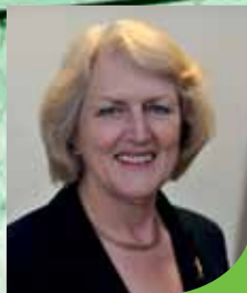
Baroness Young of Old Scone Founding Chairman of Care Quality Commission Chancellor of Cranfield University